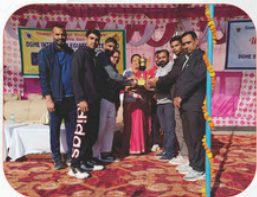
INTER COLLEGE STATE (DHE) JUDO OVER ALL CHAMPIONS