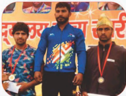
GOLD IN WRESTLING