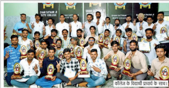
कॉलेज के विद्यार्थी प्राचार्य के साथ।

सरसा। शाह सतनाम जी शिक्षण संस्थान के छात्र छात्राओं ने एक बार फिर अपनी प्रतिभा का प्रदर्शन करते हुए चौ. देवीलाल विश्व विद्यालय की टॉप टैन लिस्ट में सबसे अधिक सीटें हासिल की हैं। शाह सतनाम जी गर्ल्स कॉलेज की छात्राओं ने जहाँ मैरिट लिस्ट में 107 सीटें कब्जाई वहीं शाह सतनाम जी बॉयज कॉलेज के 51 छात्र भी मैरिट सूची में टॉप में रहे। सात