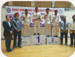
ALL INDIA INTER UNIVERSITY JUDO BRONZE MEDAL