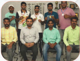
ALL INDIA SILVER AND ONE BRONZE MEDAL IN BOXING