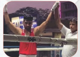
ALL INDIA SILVER IN BOXING (68 KG)