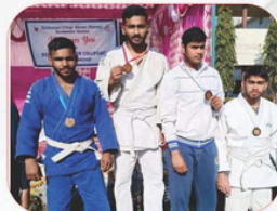
GOLD IN ALL INDIA INTER UNIVERSITY GRAPPLING CHAMPIONSHIP