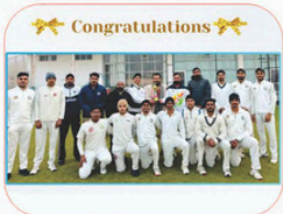
INTER COLLEGE GOLD IN CRICKET