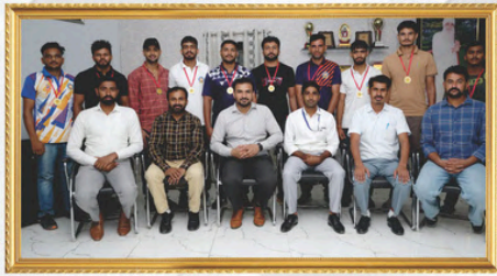
4 GOLD IN ALL INDIA INTER UNIVERSITY CIRCLE KABADDI