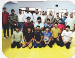
8 GOLD IN INTER COLLEGE WRESTLING