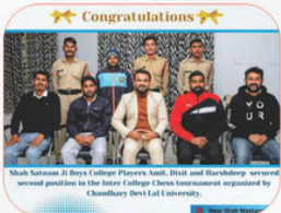
SILVER IN INTER COLLEGE CHESS