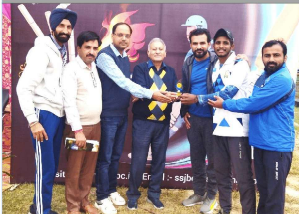
01/12/21, Principal, administrator sir and Staff members honouring the man of the match.