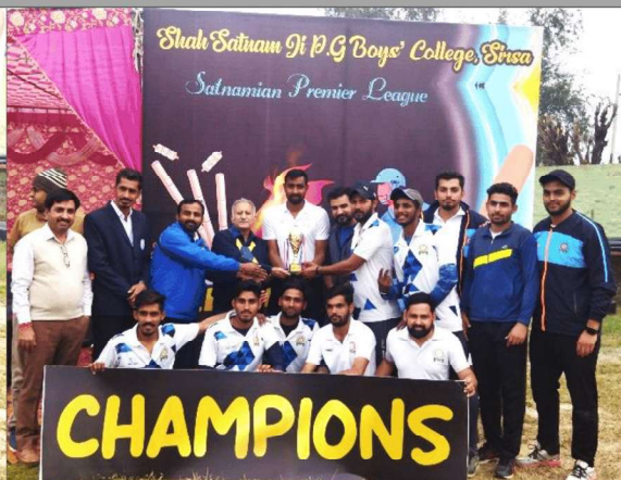
01/12/21, Principal and administrator sir honouring the winner.