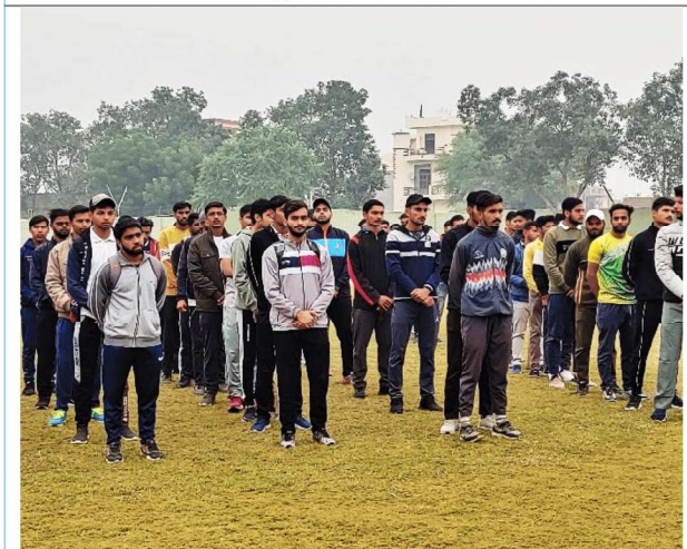
01/12/21, Group photo of teams Inter-departmental SPL Cricket Tournament.