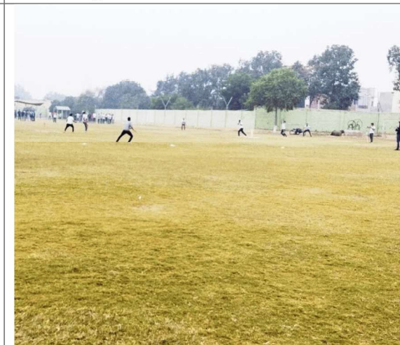
01/12/21, Students playing cricket.